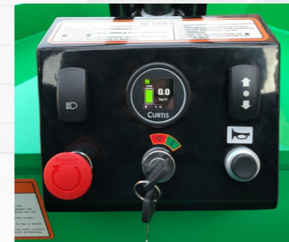
The ergonomically designed dashboard with a LCD color display instrument.