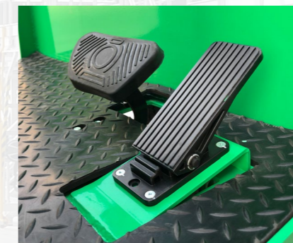
Large Brake Pedal with Integrated Parking Brake Design