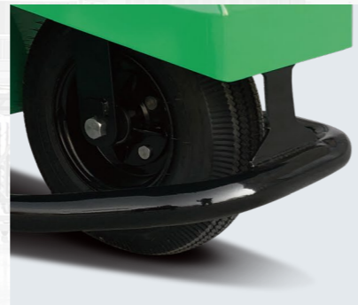
The Front Anti-Collision Bar