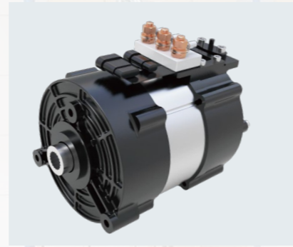
The AC Brushless Drive Motor