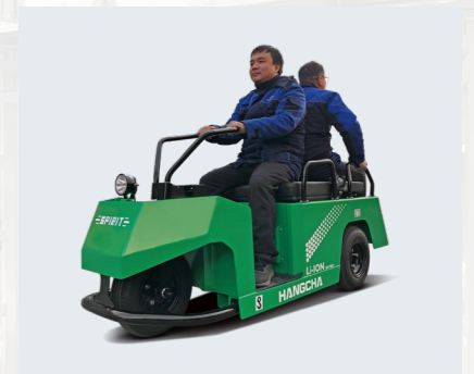
With the backrest folded down, the Electric Utility Vehicle can carry an additional person.